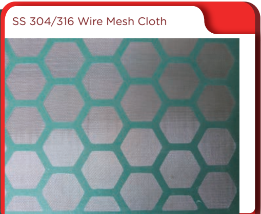
SS 304/316 Wire Mesh Cloth