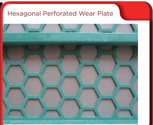
Hexagonal Perforated Wear Plate